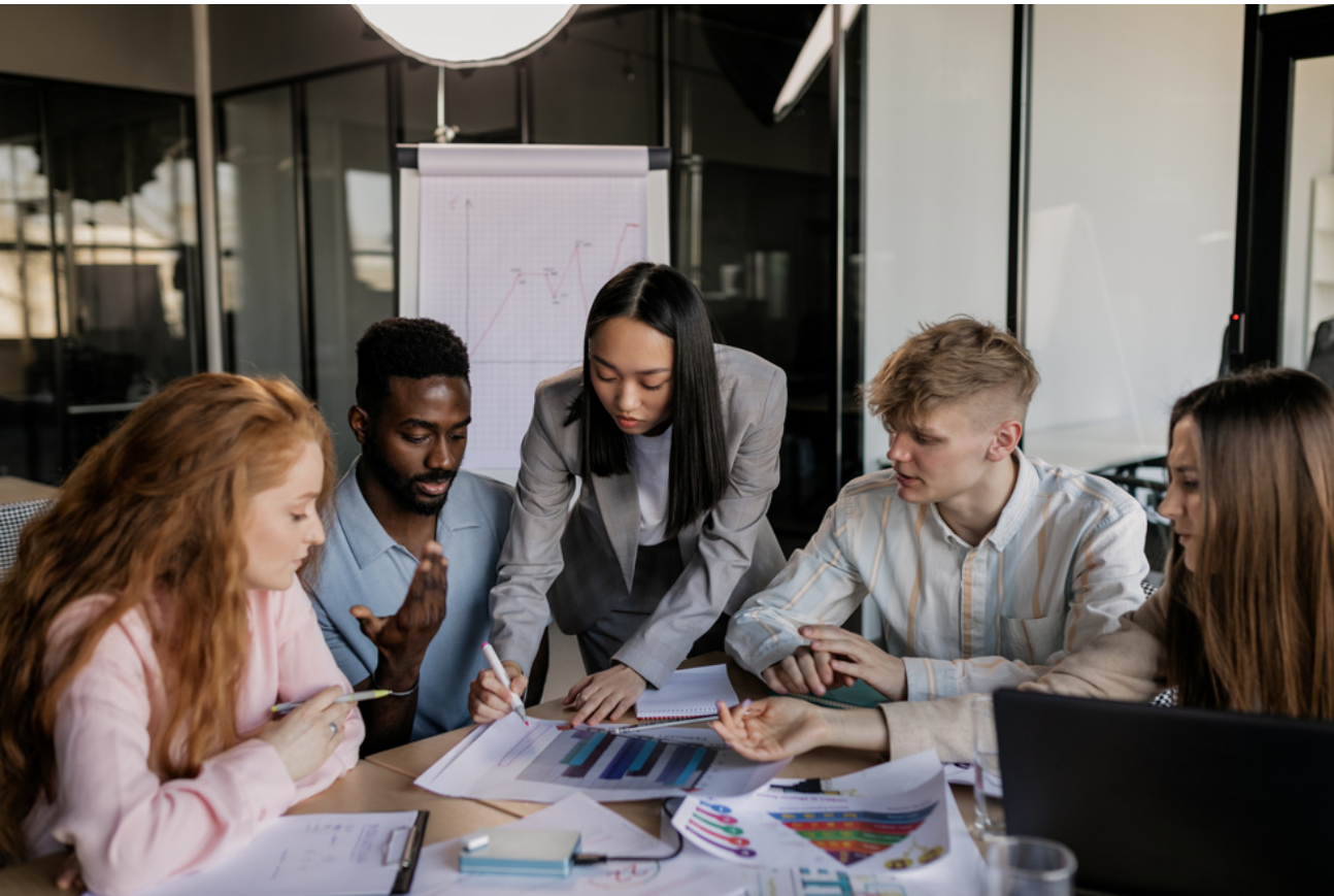
Add captions as needed

All data courtesy of Oregon Employment Department - "on-the-map" tool.